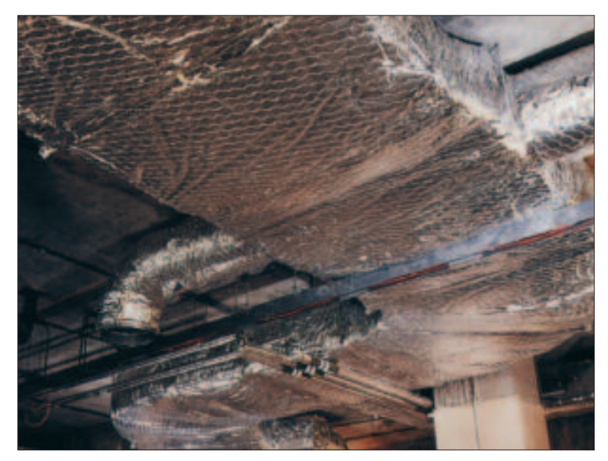
Rockwool Ductwrap used to thermally and acoustically insulate ducting

Ductwrap is a lightweight, flexible insulation roll faced with reinforced aluminium foil. Ductslab is a semi-rigid insulation slab faced with reinforced aluminium foil.